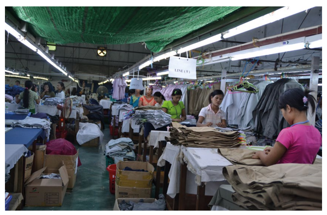
A garment factory in Myanmar (this factory was not included in the research).