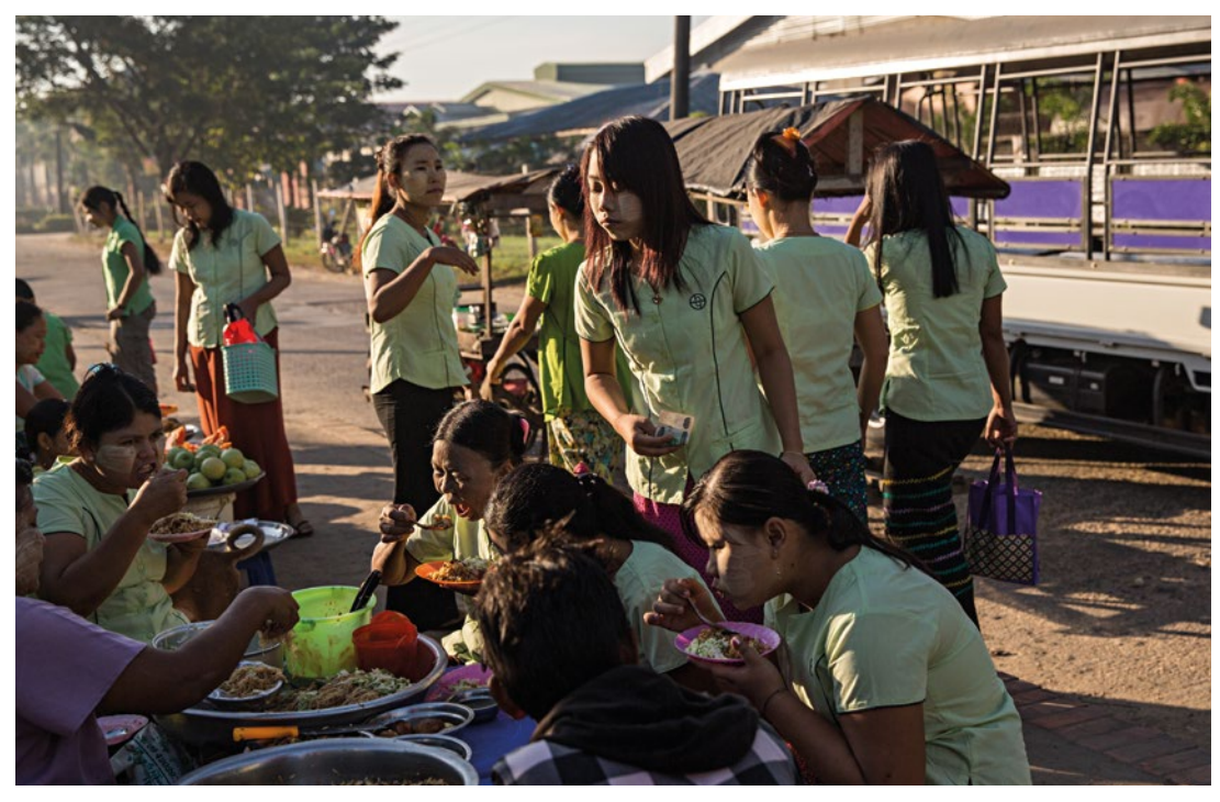
Garment workers eat breakfast at a small stand.