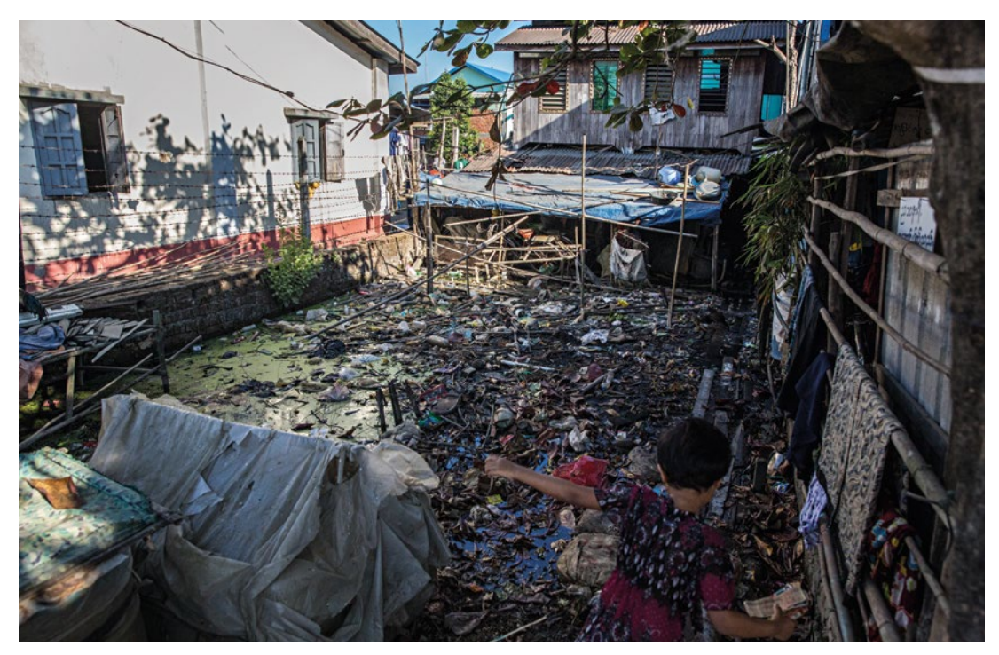
A young girl walks into her home, where many garment factory workers live. The area is full of trash and is flooded with dirty water.

and human rights risks, unless expressly stated.<sup>60</sup> The SIA final report expected the textile sector "to derive net positive gains from an EU-Myanmar IPA in all sustainability issue-areas."<sup>61</sup>