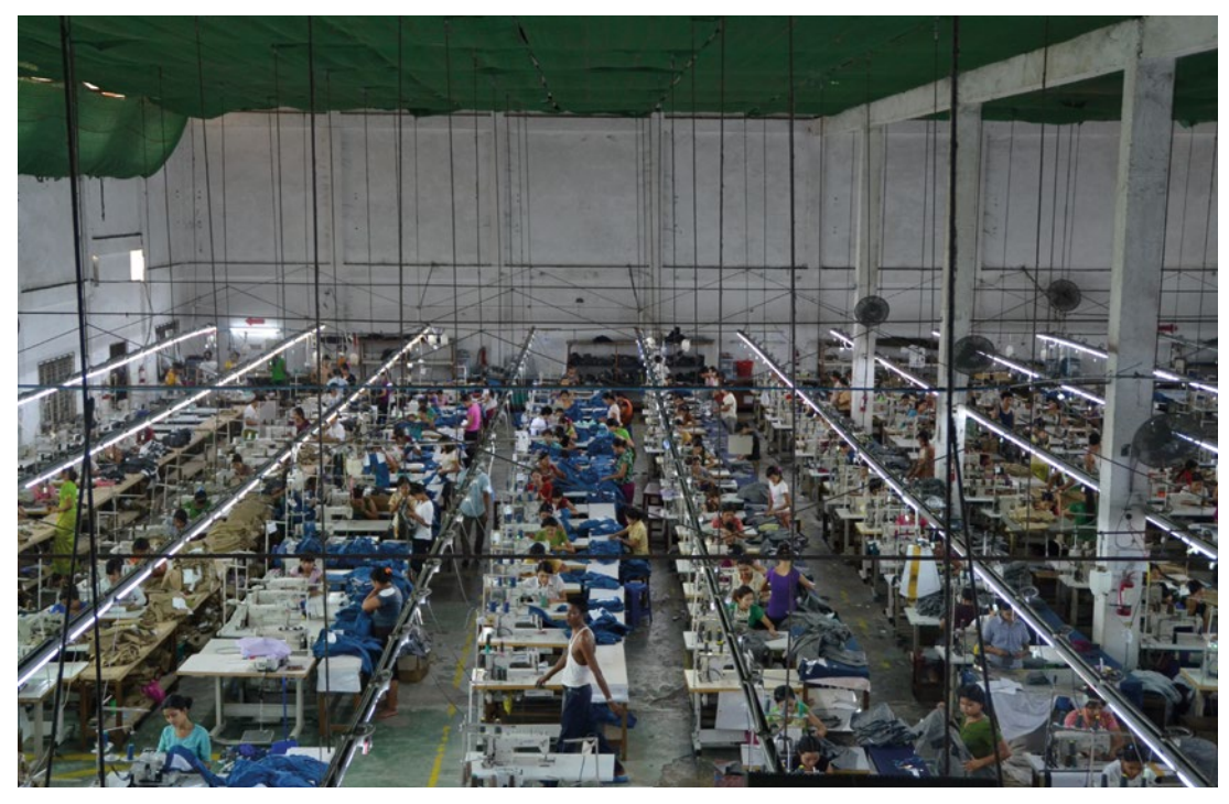
A garment factory in Myanmar (this factory was not included in the research).

and dispute settlement and the presence of labour unions and CSOs, the SEZs have special rules. Human rights and labour rights are not necessarily well served in these zones.