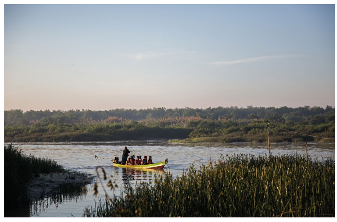
Garment factory workers travel by boat to work in the morning from a small village across the canal.

supplier list mentioned a number of factory names that no longer appear on the December 2016 version. According to C&A, one of the factories could not meet C&A's delivery deadlines. At two other factories, production was suspended due to poor audit results.