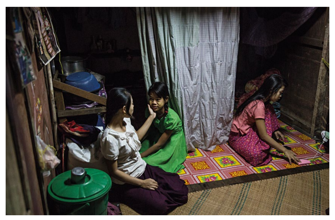
Garment factory workers sit in their home at the end of their work day.

The legal minimum wage applies across the country and across sectors and industries, but with the following exemptions: