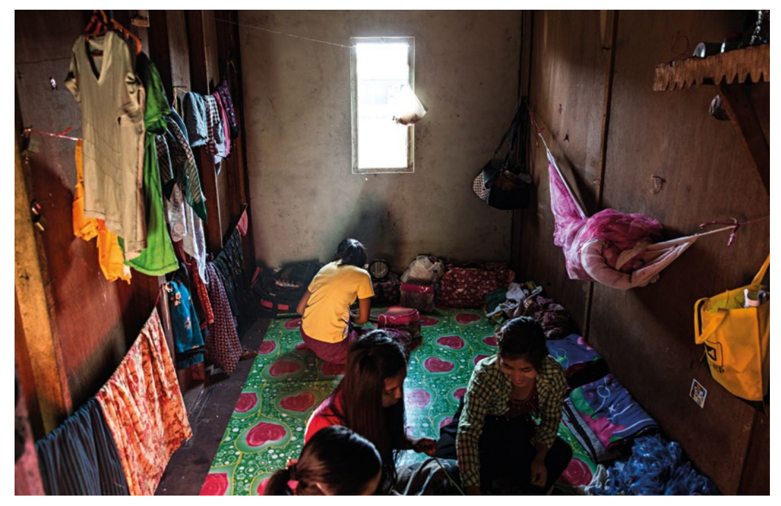
Garment factory workers prepare food in their small dormitory room in Yangon, Myanmar.