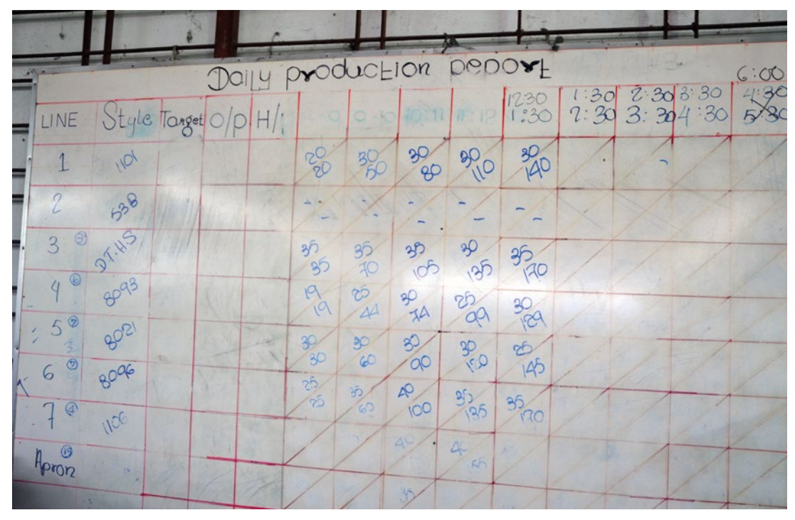
Planning board in a garment factory (this factory was not included in the research).

outright poverty wages. In addition, these clauses open the door to abuse as employers may dismiss workers after six months and hire new workers in order to avoid paying minimum wages.