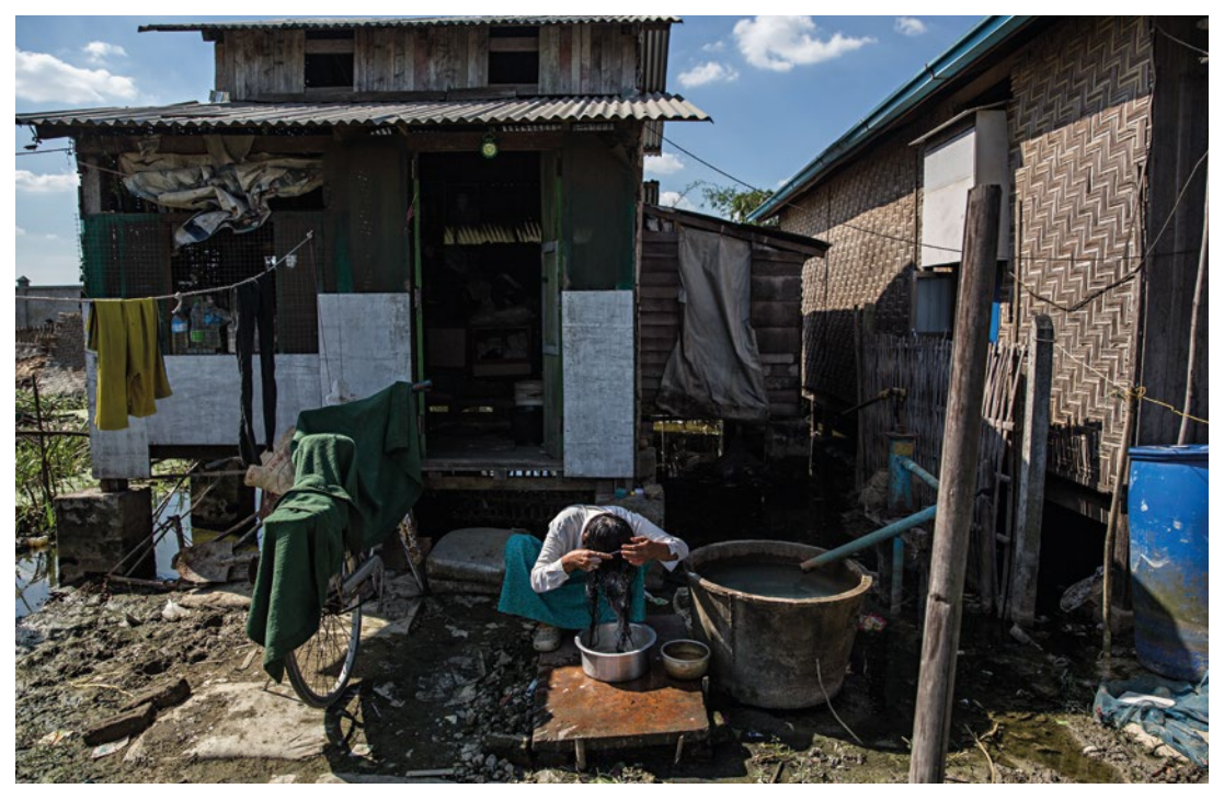
A woman washes her hair outside of her home in a squatter village where many garment factory workers live.

FWF wrote that information gathered through an FWF audit (May 2016) and a training session in December 2016 did not substantiate these findings. FWF is investigating the matter further.<sup>191</sup>