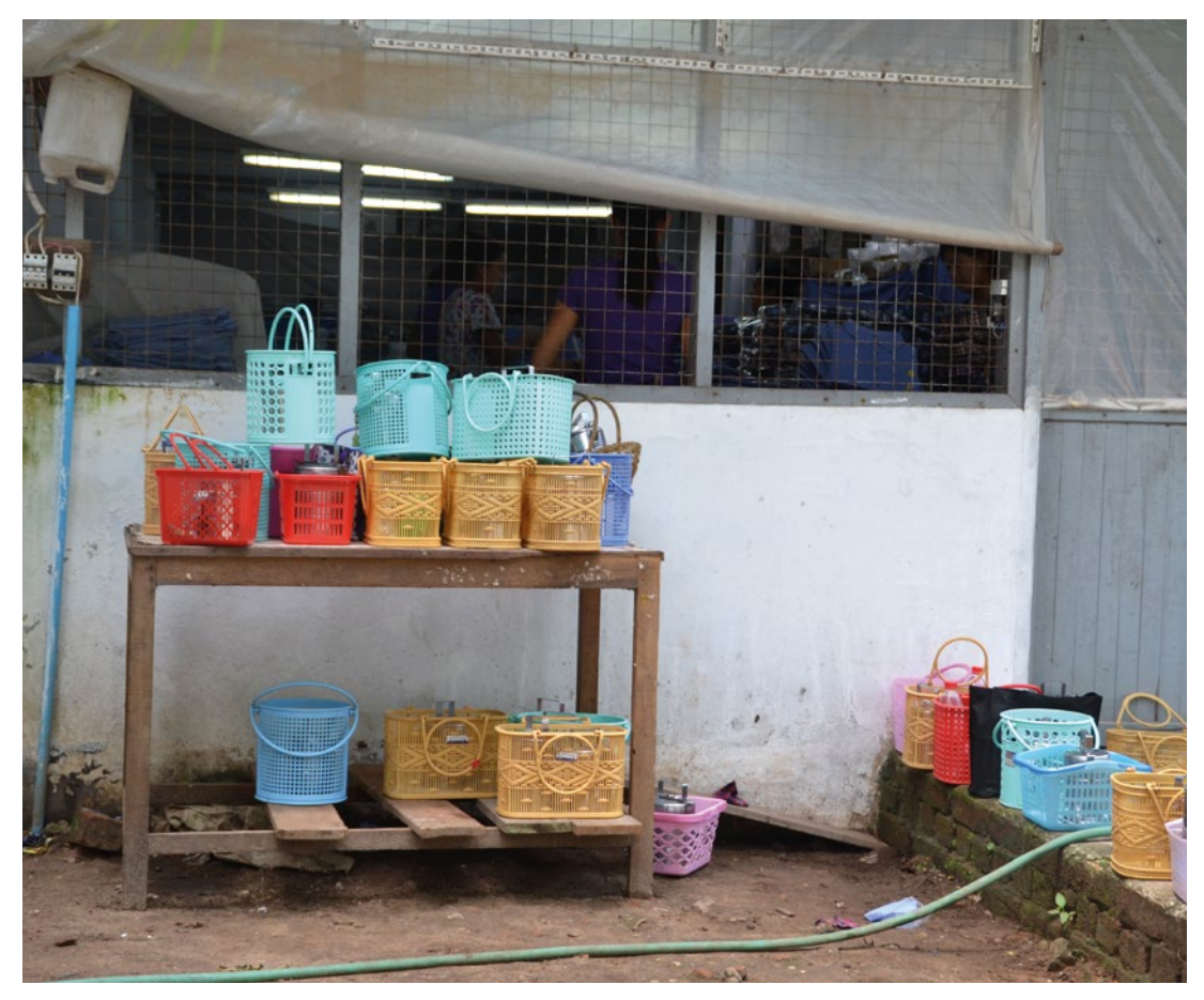
A garment factory in Myanmar (this factory was not included in the research). Martje Theuws | SOMO

At Factory 5, more than half of the interviewed workers were aware about trade union rights, as they had been in contact with ALR on different occasions. Some of the interviewed workers said they were interested in forming a trade union.