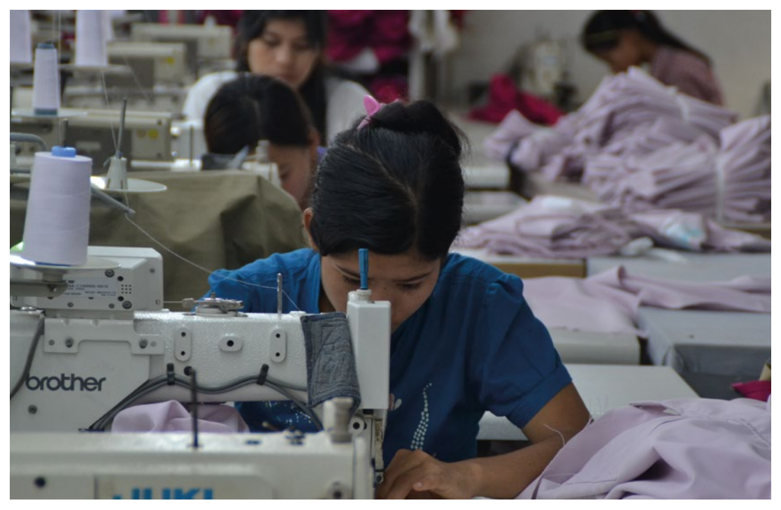
A garment factory in Myanmar (this factory was not included in the research).

They provide a mediation and conciliation platform for resolving practical issues that may arise with the implementation of the Guidelines.<sup>88</sup>