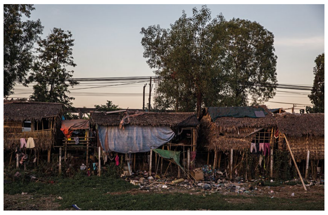
Squatter area for garment factory workers.

include risks related to land grabbing, questionable ownership and military influence, the powerful presence of foreign-owned garment factories, child labour and the position of ethnic workers.