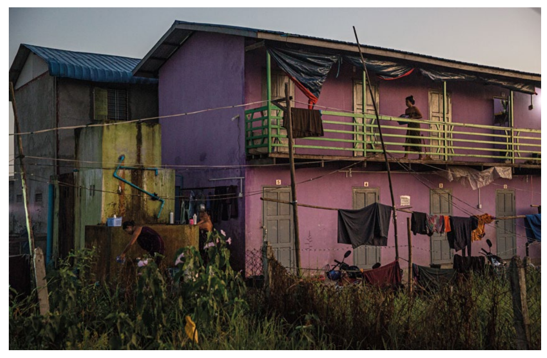
Exterior of a dormitory for garment factory workers. Lauren DeCicca | MAKMENDE

understanding that the Myanmar labour movement and civil society is in full development; unions and labour NGOs are being established as we speak.