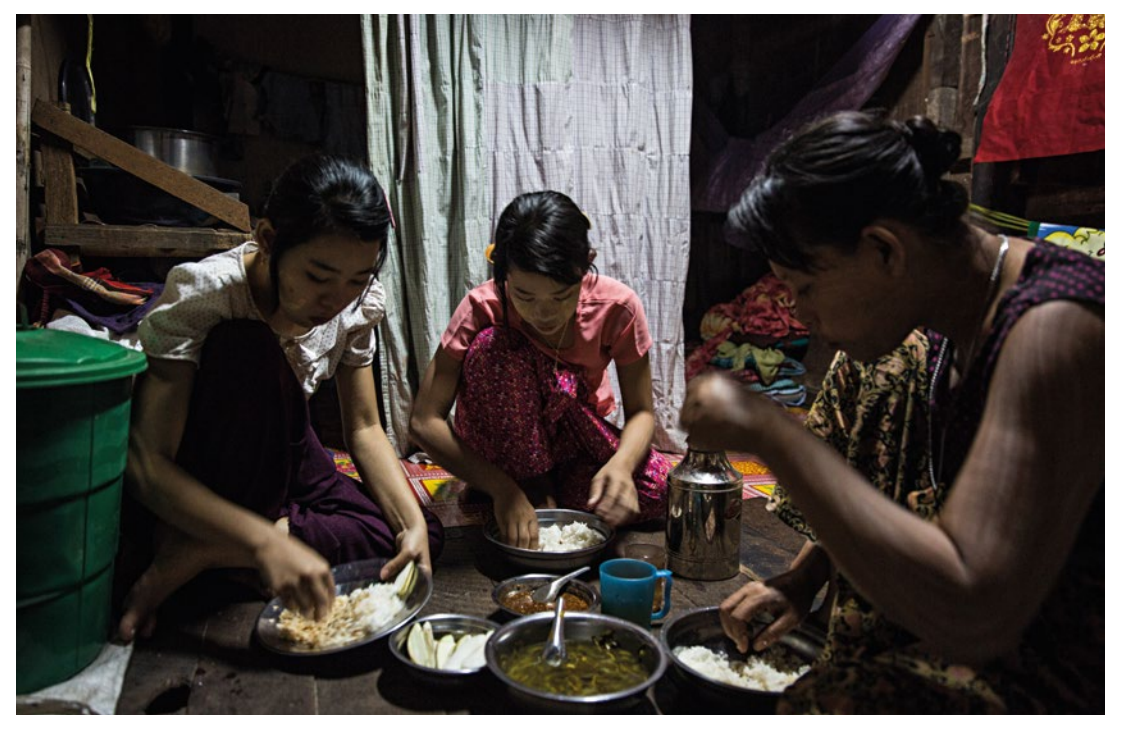
Garment factory workers eat dinner in their small home.