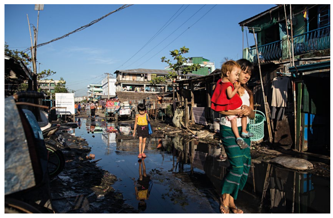
A woman and children walk down the flooded streets of Yangon's Hlaing Tharyar industrial Zone, an area that houses many garment factory workers.

Moreover, the current administration relies heavily on civil servants who served under the previous government – including, for example, the Director General and the Secretary of the Ministry of Labour. District and township level dispute handling bodies are also still run by civil servants who have been in post since the days of the military regime.