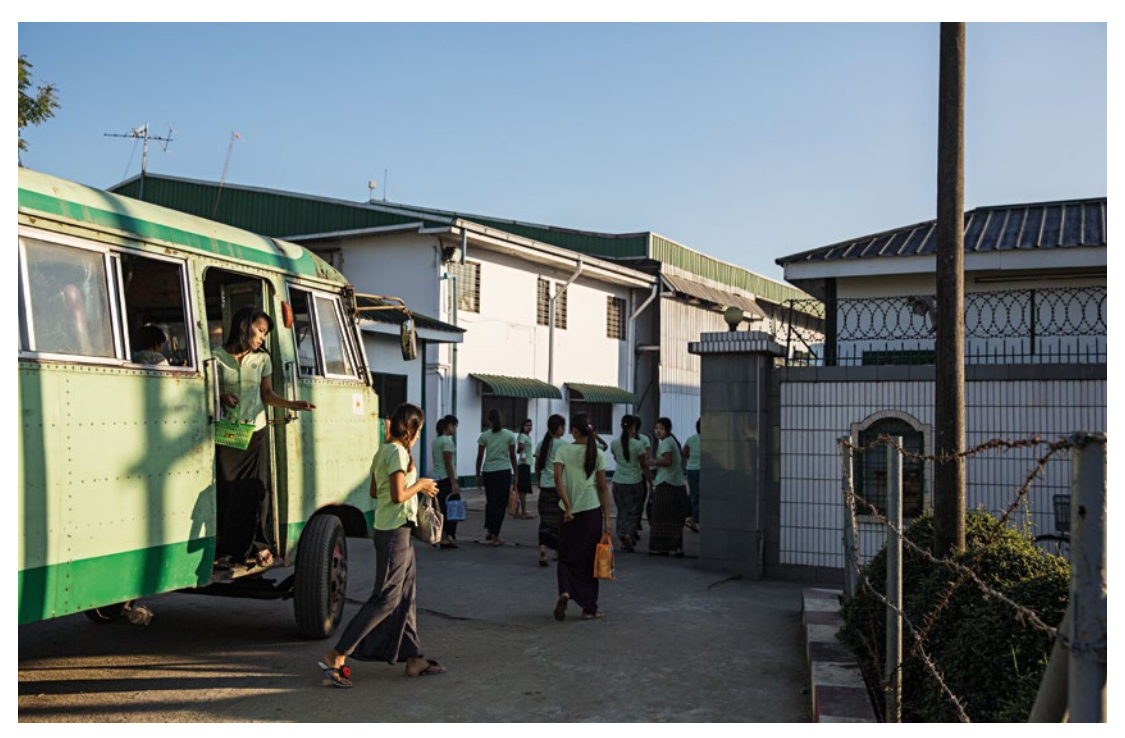
A shuttle bus drops off workers..