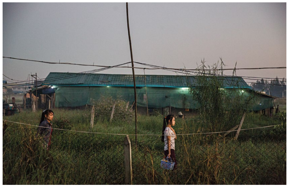
Garment factory workers walk down the footpath near their home on their way to work. Lauren DeCicca