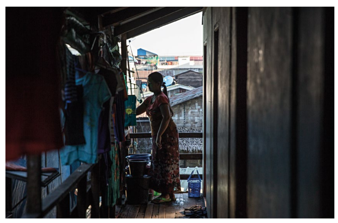
A garment factory worker hangs clothes out to dry at her dormitory in Yangon, Myanmar.

In May 2010, FWF adopted a formal position on Myanmar. At that time FWF was of the opinion that the situation in Myanmar was such that there was insufficient foundation for a credible process that could lead to improvements in working conditions in factories and that there was no credible structure for strengthening social dialogue between local stakeholders. Consequently, FWF required members and prospective members to phase out production at factories in Myanmar.<sup>241</sup>