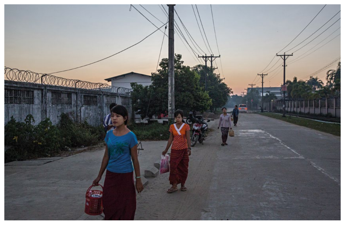
Garment factory workers walk to the factory in the early morning before work.

Reaction to factory findings: Deuter wrote to SOMO that it does not source from Factory 5 but from this unit. This unit and Factory 5 are part of the same company. The two factories are located at the same premises and fall under another unit of the same company. Both factories have been audited by FWF in May 2016. Deuter wrote that the results of the May 2016 FWF audit did not substantiate the working conditions as described by SOMO. Deuter wrote that the SOMO's findings regarding the employment of young workers were not confirmed by the audit. The youngest worker found during the audit was 18 years old. In its Social Report 2015 (reporting period July 2015-June 2016), Deuter summarised the results of the audit.