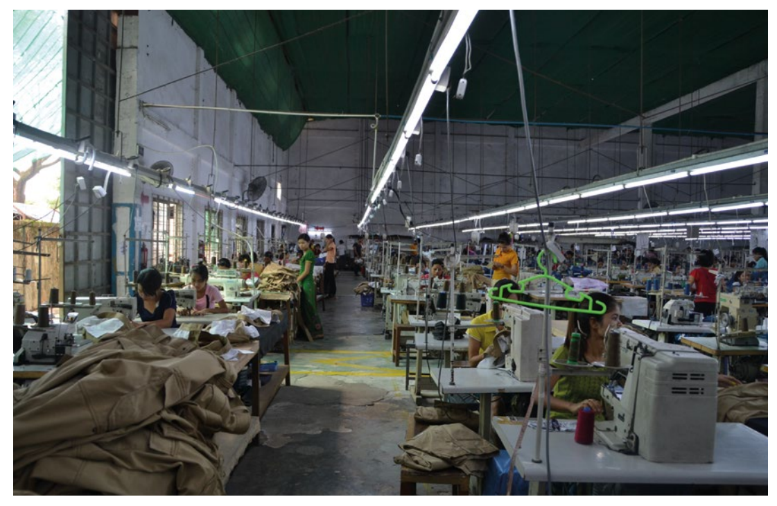
A garment factory in Myanmar (this factory was not included in the research).

Daily labourers were found to be among the workforce at four of the 12 investigated factories. Daily labourers do not sign contracts; they only receive the basic daily wage, which may be below the minimum wage of 3,600 kyat (€2.48) per day; they are not eligible for bonuses and benefits; and they are not covered by the social security system. In addition, daily labourers have very insecure jobs as in the absence of a formal employment relationship they are easily dismissed.