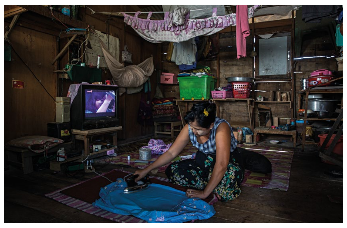
A woman irons clothes in her home.

Employers should, as a standard practice, conduct thorough age checks when hiring workers by checking their documents (NRC, township registration or birth certificate) and requiring a medical check. Young workers of 16-18 years old can only be employed with a valid CoF. Employers should be aware of unqualified medical bodies issuing forged certificates and NRCs. The employer should cover costs of CoF examinations. Buying companies, in turn, should be aware of their suppliers' administration and records being peppered with falsified documents.